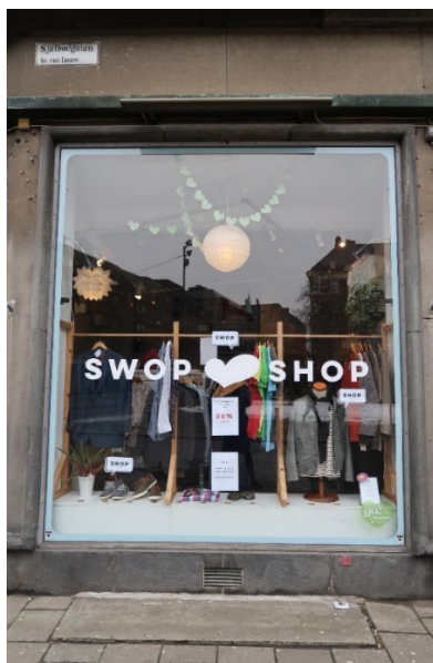
Figure 4. Swop Shop – a clothes swapping boutique in Malmö

According to the Swop Shop manager, attracting and maintaining customers is a challenge, as swapping is associated with a certain type of behaviour – "one has to be a swapper". Swapping requires time and attention, as it is very rare that a customer comes to the Swop Shop and finds a garment in the precise style and size, and "just what they want". The manager is optimistic about the future of swapping as, potentially, any consumer item can be swapped. However, she, thinks that "it will be at least five years more before this becomes common, if it doesn't speed up the municipality nudging people", so identifying the role of the City of Malmö in the sharing economy as important.